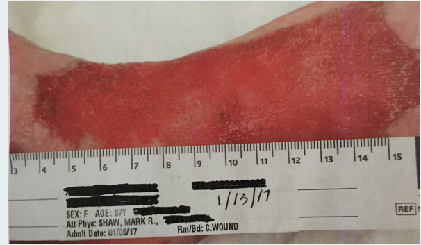
Epidermal Grafting Application Day