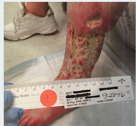
9 Weeks Post Debridement/ Hydrofiber With Silver Dressings