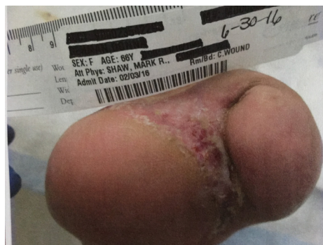
Wound Closure 7 Weeks Post Epidermal Graft