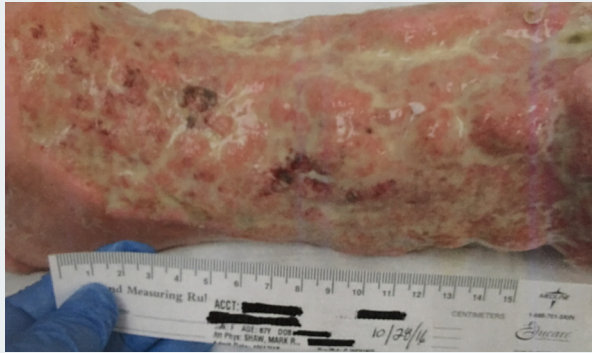
NPWT Initiated (13 Week Application)