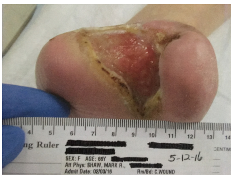
13 Weeks Npwt/Epidermal Graft Application