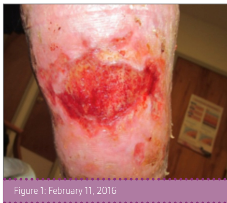
Figure 1: February 11, 2016