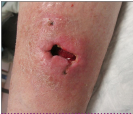
Figure 6: January 10, 2017