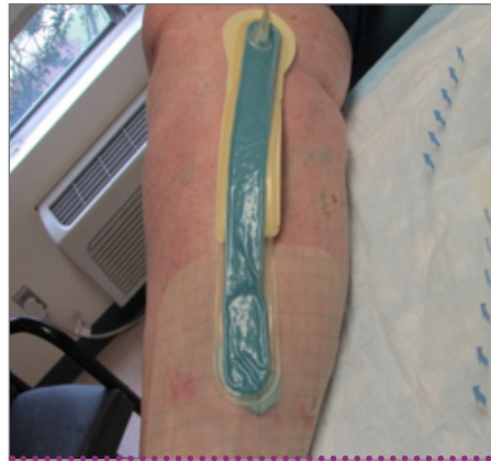
Figure 9: March 7, 2017