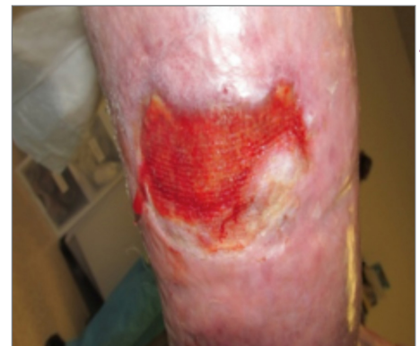
Figure 4: March 3, 2016