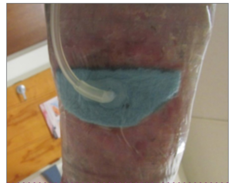
Figure 2: February 11, 2016