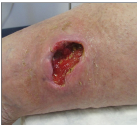
Figure 7: February 9, 2017