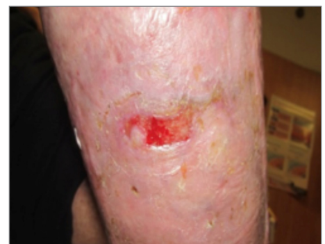
Figure 5: April 15, 2016