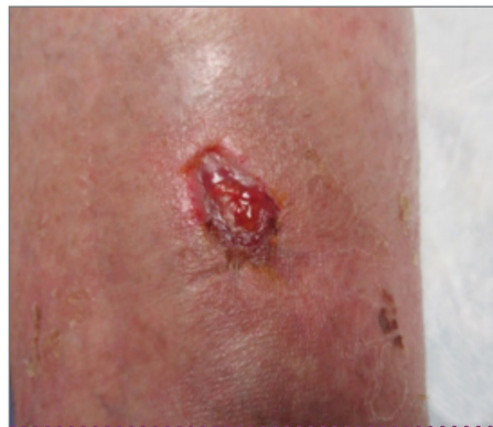
Figure 10: April 4, 2017

In conclusion, our experience demonstrates that the SNAP™ Therapy System is a truly unique and versatile method of utilizing the multi-tasking abilities of NPWT in the wound clinic where it is most needed. The system is low-cost, equally as effective as electrically powered NPWT 15 , positively reimbursed and designed for the smaller, low-exudate chronic wound that is typically encountered in outpatient and home care settings. In our center's opinion, the SNAP™ Therapy System is the future of outpatient NPWT available now.