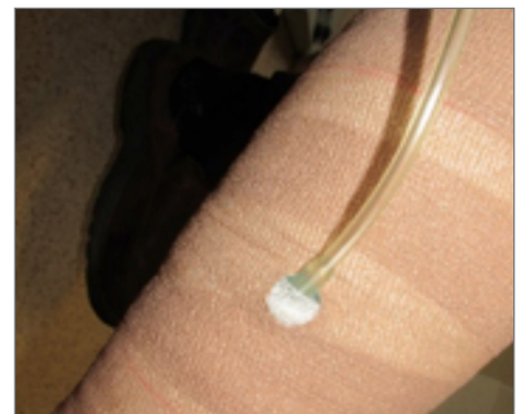
Figure 3: February 11, 2016