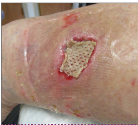
Figure 8: March 7, 2017