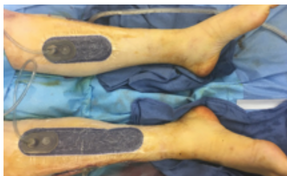
FIGURE 2. Application of PREVENA™ Therapy