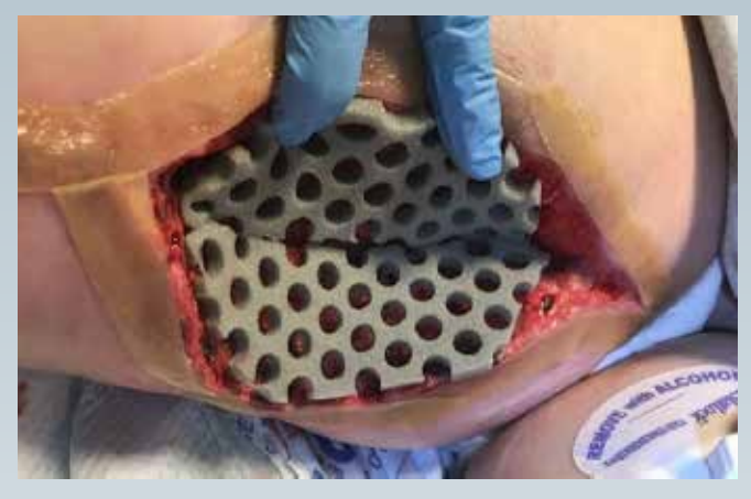
FIGURE 3. First application of V.A.C. VERAFLO CLEANSE CHOICE™ Dressing (Day 0)