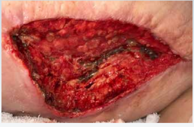
FIGURE 5. Debridement at bedside and placement of V.A.C.® GRANUFOAM™ Dressing (Day 6)