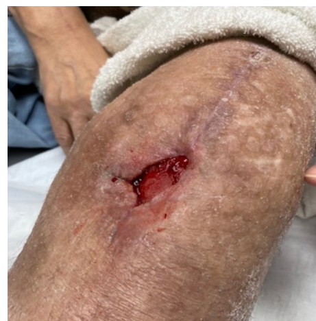
Figure 8. Leg wound following removal of Veraflo Therapy and Dermatac Drape; Note healthy periwound skin after dressing takedown