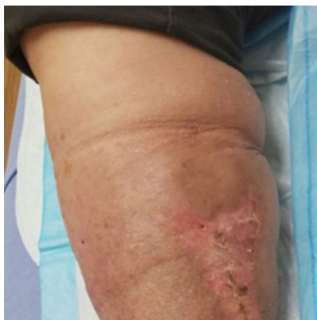
Figure 6. Wound fully closed without complications at the 5-month follow-up; adapted from Napolitano 2018. 3