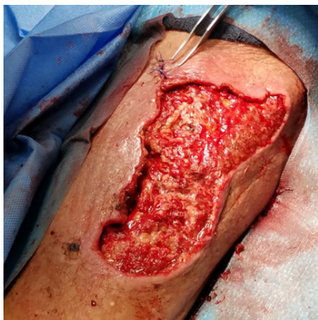
Figure 2. Intraoperative photo of wound undergoing sharp debridement and pulsed lavage; photo courtesy of Ralph J. Napolitano, Jr., DPM, CWSP, FACFAS; adapted from Napolitano 2018. 3