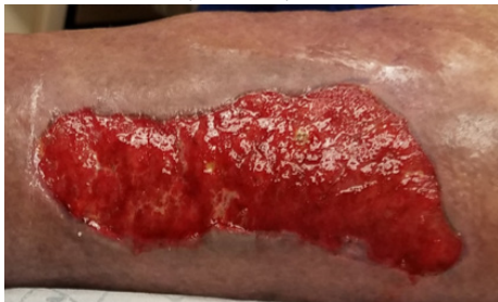
Figure 5. Wound after 21 days of V.A.C.® Therapy; adapted from Napolitano 2018. 3