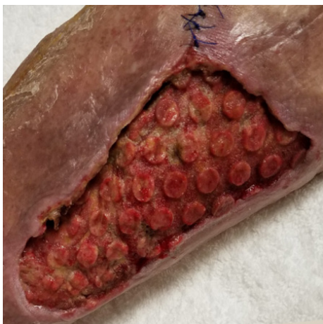
Figure 4. Wound after 3 days of Veraflo™ Therapy with Veraflo™ Cleanse Choice Dressing; photo courtesy of Ralph J. Napolitano, Jr., DPM, CWSP, FACFAS; adapted from Napolitano 2018. 3