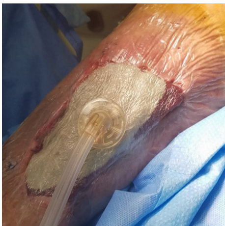
Figure 3. Application of Veraflo™ Therapy with Veraflo Cleanse Choice™ Dressing; adapted from Napolitano 2018. 3