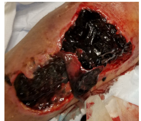
Figure 1. Initial presentation of gelatinous hematoma; adapted from Napolitano 2018. 3

syndrome sequelae was noted ( Figure 1 ). The patient underwent surgical debridement and pulsed lavage ( Figure 2 ). Veraflo Therapy using 3M TM V.A.C. Veraflo Cleanse Choice TM Dressing was applied in the operating room. Normal saline (30 mL) was instilled into the wound bed with an 8 minute dwell time, followed by 3.5 hours of continuous negative pressure at -125 mmHg ( Figure 3 ). Dressings were changed every 2-3 days. After 3 days of Veraflo Therapy with V.A.C. Veraflo Cleanse Choice Dressing, healthy granulation tissue was observed in the wound bed ( Figure 4 ). Veraflo Therapy was continued for a total of 6 days, after which, the patient was discharged to a skilled nursing facility with V.A.C. ® Therapy (continuous negative pressure at -125 mmHg, with dressing changes every 2-3 days). After 21 days of V.A.C. ® Therapy, the wound was 100% covered with healthy granulation tissue and ready for a skin graft procedure ( Figure 5 ). Epidermal skin grafting was performed, and the wound healed without complications ( Figure 6 ).